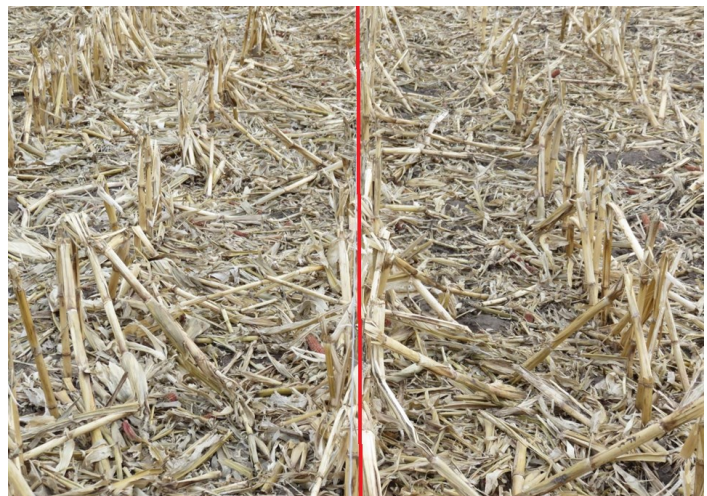
Figure 2. Ungrazed (left) and grazed (right) corn residue. Targeted removal rate to maintain cattle performance is only 15% of residue.

Information related to grazing of corn residue can be found at beef.unl.edu/cropland including things to consider when developing rental agreements.